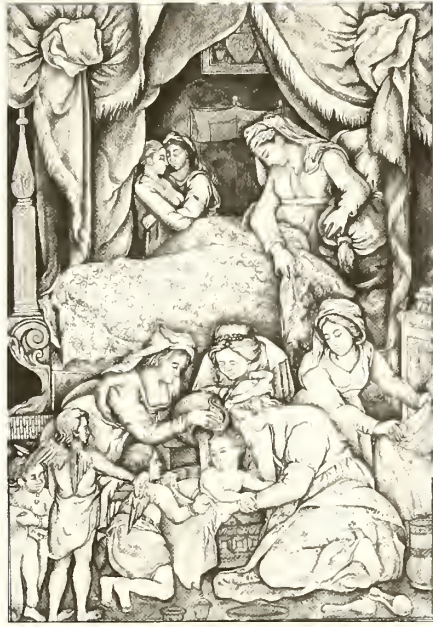
Figure 27. The Birth of the Virgin , after Cornelius Cort (Dutch, 1500s). India, Mughal period, Salim studio, Akbar period, ca. 1599–1605. Album page; ink on paper, image: 21 x 14, folio: 34.5 x 21. Free Library of Philadelphia, Rare Book Department, John Frederick Lewis Collection of Oriental Manuscript Leaves M.93

Hieronymus Wierix's (1553–1619) Entombment (1580s) expertly translates the hatching into wash (see fig. 26). 42 This technique is also seen in two delicately modeled drawings of The Birth of the Virgin after Cornelius Cort's (active 1500s) print of a painting by Taddeo Zuccaro (1529–1566); both use wash and hatching effects (fig. 27). 43